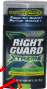
DEOD STICK 12/2.7 OZ