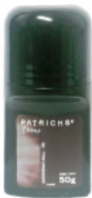
DEOD ROLL ON LUOMO 12/50 GR