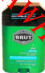
BRUT DEOD STICK 12/2 OZ