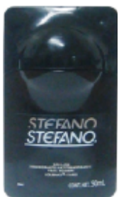
DEOD ROLL ON 12/50 GR