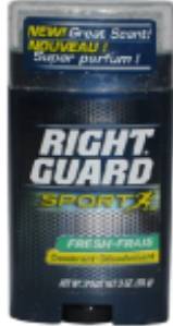
DEOD STICK FRESH 12/3 OZ