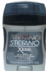
DEOD STICK XTASIS 12/60 GR