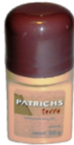
DEOD ROLL ON TERRA 12/50 GR