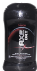
DEOD STICK TOUCH 12/3 OZ