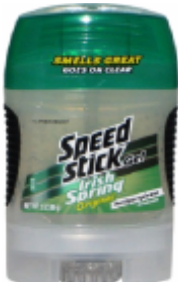
DEOD GEL ORIGINAL 12/3 OZ