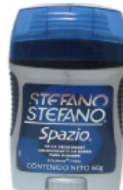
DEOD STICK SPAZIO 12/60 GR