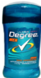
DEGREE DEOD IONIC 12/1.7 OZ