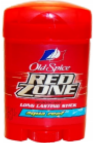
DEOD PURE SPORT 12/2.25 OZ