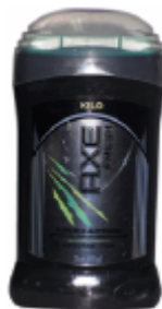
DEOD STICK KILO 12/3 OZ