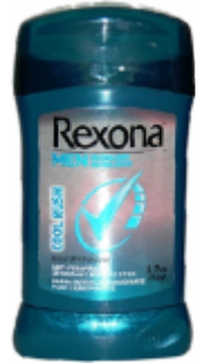
DEOD STICK 12/2.7 OZ