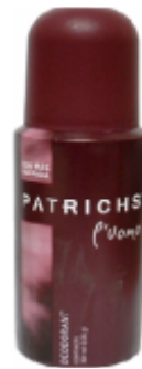
DEOD SPRAY LUOMO 12/105 GR