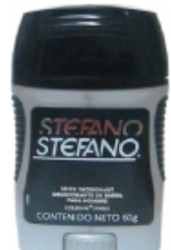
DEOD STICK NEGRO 12/60 GR