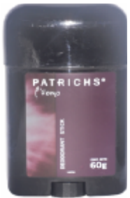
DEOD STICK LUOMO 12/60 GR