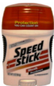
DEOD MUSK 12/2 OZ