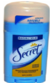
DEOD STICK 12/1.5 OZ