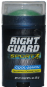
DEOD STICK COOL 12/3 OZ