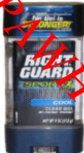
DEOD STICK COOL 12/4 OZ