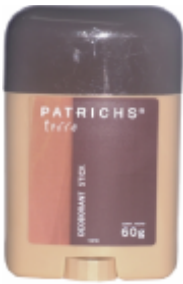
DEOD STICK TERRA 12/60 GR