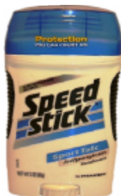
DEOD SPORT TALCO 12/3 OZ