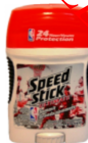
DEOD SUMMIT 12/55 GR