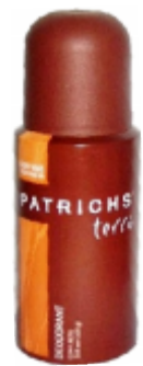
DEOD SPRAY TERRA 12/105 GR