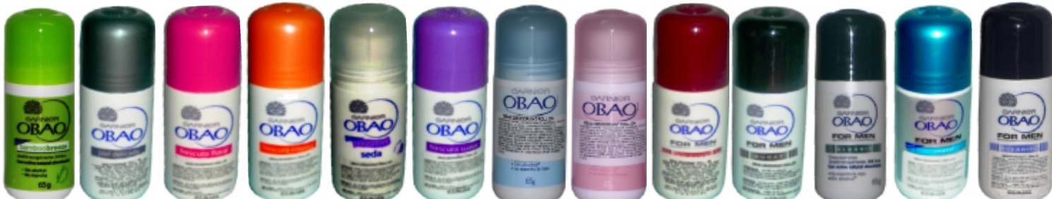
OBAO MUJER BAMBOO, DELICADA, FLORAL, INTENSA, SEDA, SUAVE 12/65 GR